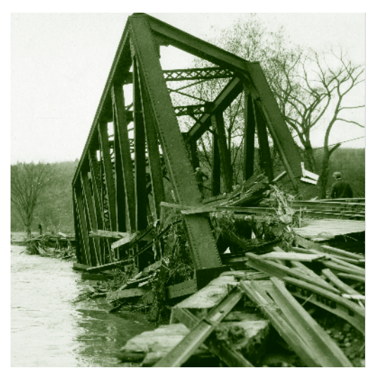
Montpelier 1927, CVRR Bridge

No Adverse Impact watershed management relies on a combination of development planning, standards, and review to ensure that proposed and anticipated development will not adversely impact other property interests through increased runoff, velocities, or degradation. Since each community is unique, NAI provides the flexibility for each community to adopt strategies to fit unique community interests, watershed dynamics, political will, vision, and goals. The town can select from among a diverse menu of options to tailor its program to its unique management needs. Under the NAI approach, the developer and community work together to identify the impacts of proposed development and explore design alternatives to avoid adverse impacts. Ultimately, the NAI approach allows for the development of appropriate mitigation measures that are acceptable to locals, neighbors, and the community as a whole.