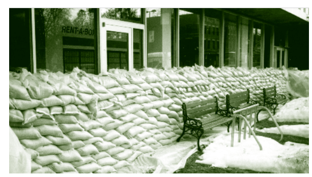
Preparing for the 2007 Flood in Montpelier

In practice, Vermont has created an interagency network of specialized agencies coordinated by Vermont Emergency Management (VEM) in the Department of Public Safety. VEM oversees federal requirements for the state and towns, which have been addressed via Vermont's regional planning commissions, to create and maintain hazard mitigation plans. During and following a natural disaster, VEM coordinates emergency response by multiple state agencies and is responsible for the distribution of grants to repair damage to public infrastructure. Engineers within the Vermont