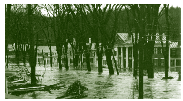
Montpelier 1927, Lower Main Street

The Vermont Agency of Natural Resources River Management Program has also created the Fluvial Erosion Hazards Program (FEH) to prevent and